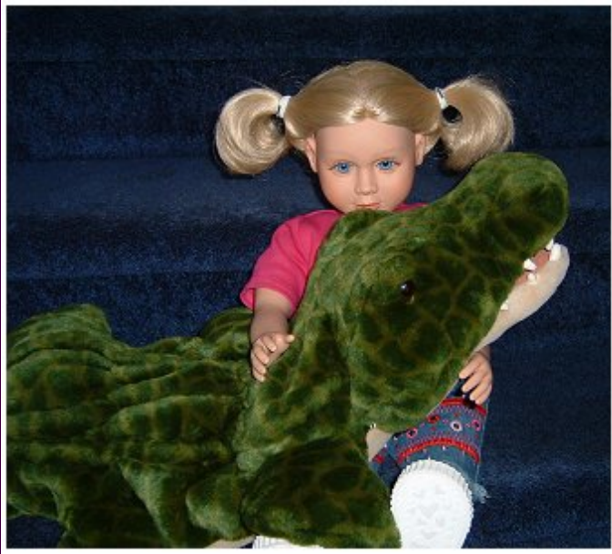
I love you, you big lug.